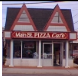
89 Main Street Kings Park NY 11754